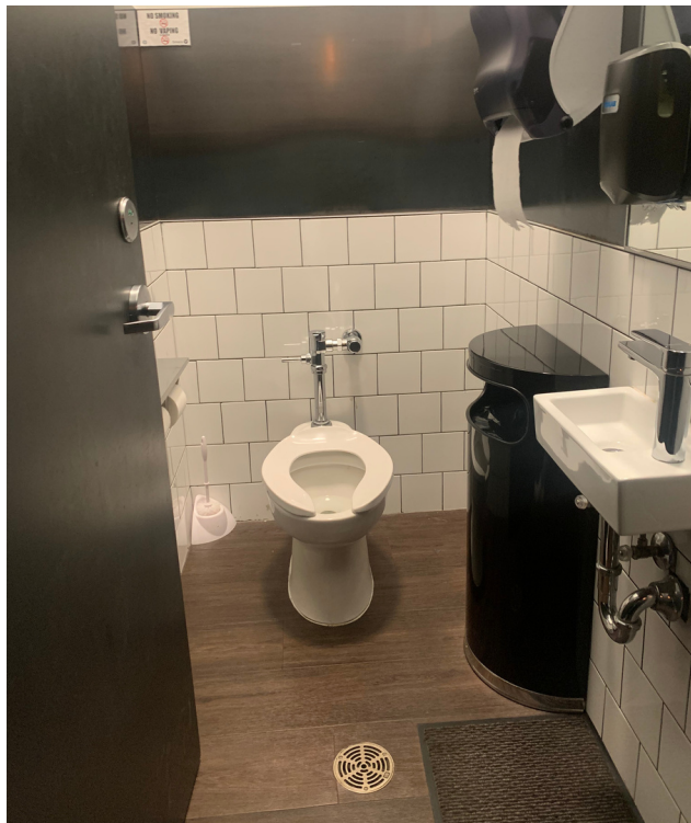
This is a gender neutral washroom.