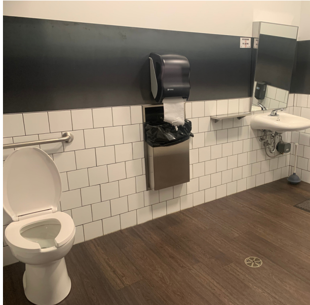
This is an accessible washroom.